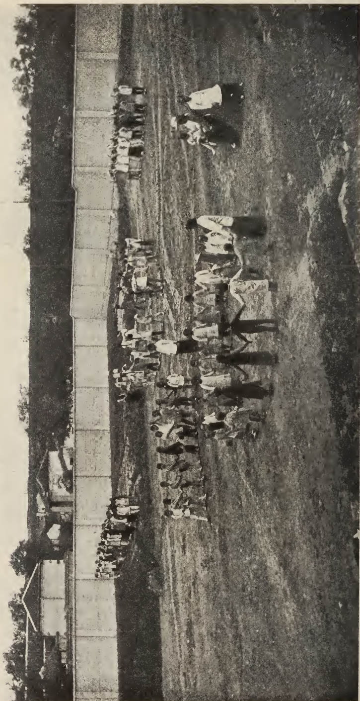
"THE OLD VEGETABLE GARDENS OF LAST YEAR"